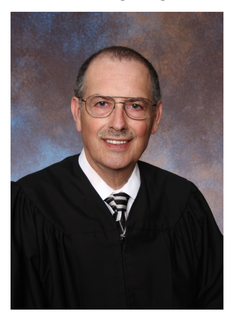
Honorable L. Brooks Anderholt Presiding Judge (January 2019-June 2019) Superior Court of California